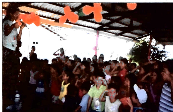
Some of the 230 kids that came to Vacation Bible School and several of them made professions.

The project is over half finished. Here are some samples of the results that are in so far. The Ouro Preto River had over 900 people hear the gospel. Forty-six were saved. Between Porto Walter