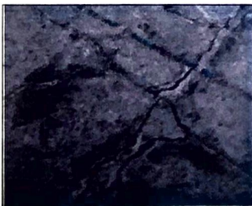
The court floor is covered in cracks and holes.