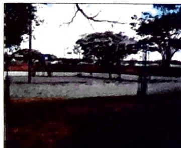
The soccer court as it stands presently.

Daily, Pastor Odali and Kathy battle to raise the $15,000 per month in operating costs (food, electricity, clothing, toiletries, supplies, etc.). The monthly fees must be met first. What good is a new bathroom if there is no electricity or water to run it? The children must eat and be clothed before other luxuries—things that we in America often take for granted such as a flushing toilet and toilet paper. We would not dare live in these conditions much less allow our children to face this. Yet, because of the