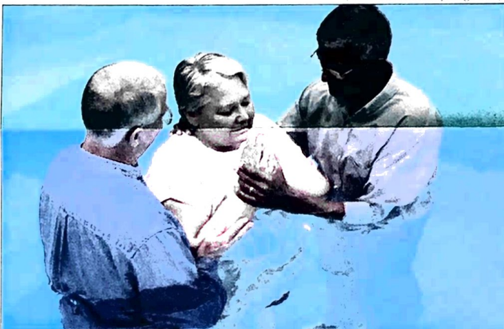
One of the seven people baptized here.