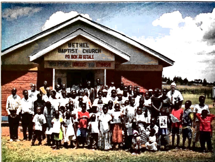
First church service at Bethel Baptist. There were over seventy-five in attendance.

On August 27th, we had our first service in the new church building which is Bethel Baptist. There were over 75 in attendance which included children, teens, and adults. We thank each of you who gave to make this a reality. Without so many helping, it would not have been possible. It is so nice to be together inside for services, as we had met in the pastor's living room and outside since March. Lord willing, we hope to have a dedication service later this month as we want this building to be used for the Lord, hopefully, every day. We have many plans for its use to teach literacy, do community projects, teach our Bible Institute students, Bible clubs on Saturday, teaching evangelism classes, and for all of the church services. God was so good to provide the money to complete it. Now it is up to us to use it for His glory and to reach many souls for Him.