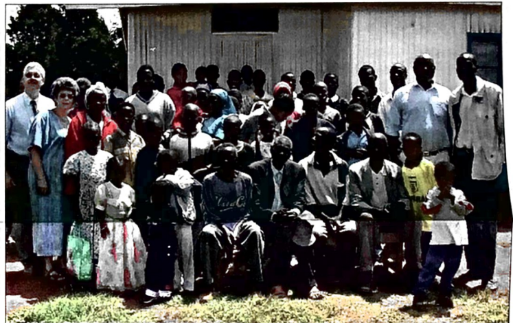
Over fifty people were in attendance at the new Bethel Baptist started on March 5th.