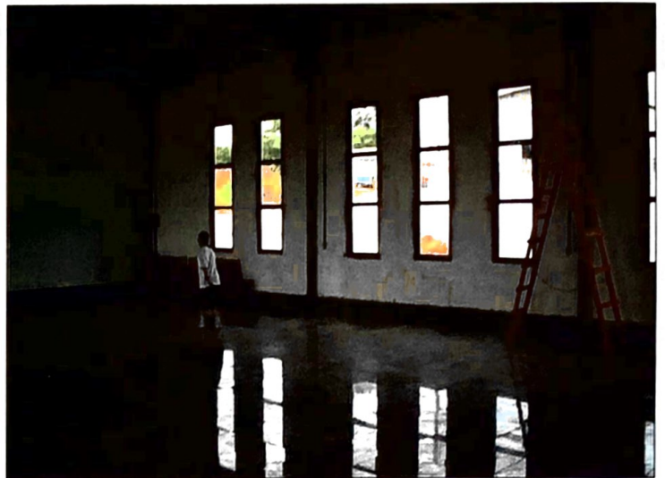
Inside of new building at Congoinhas