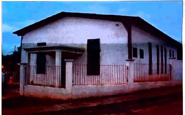
Outside of new building in Congoinhas