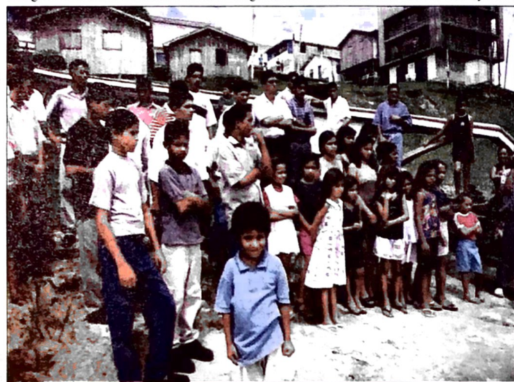
Crowd watching baptism at Thaunctuso Juruc River, Cruzeiro do Sul, Brazil.