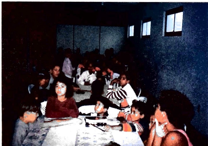
We serve a small breakfast for the children on Sunday mornings. For some it may be all they get that day.

While John was here we were able to make some of the benches needed for our different works. These were used in the mission point at Bahanco Alto. Hopefully this upcoming month we will be able to make two pulpits and some more needed benches.