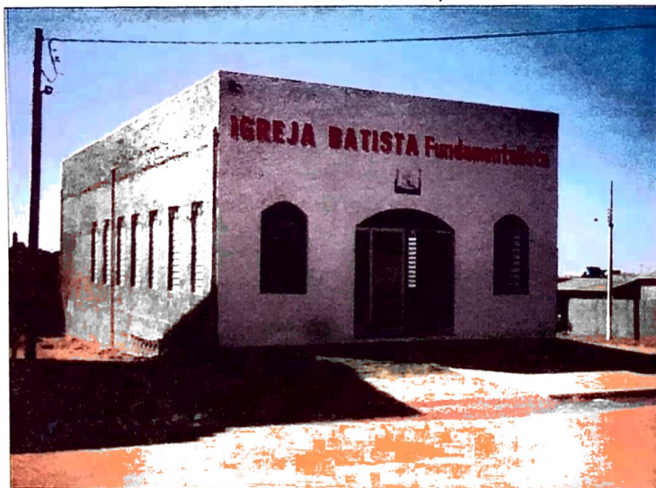
New Building built in 2003 at Primavera do Leste work the third building in three years.