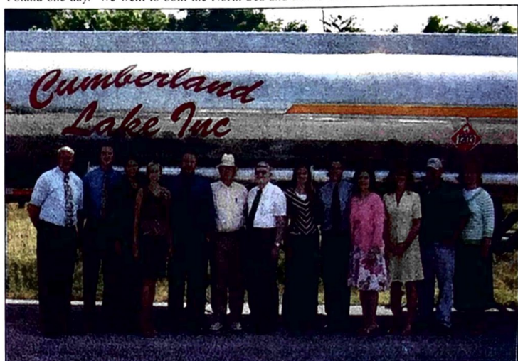
The man with the hat is a Baptist and the regional Distributor of Shell Oil. He contributed a generous sum for this group going to Brazil with Mission Adventure Team. The three on the right are his office employees.