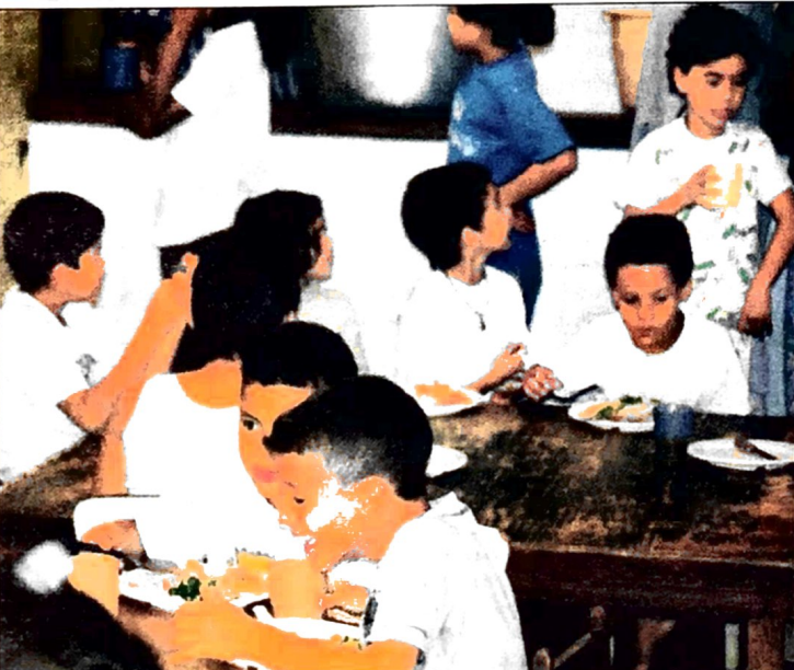
Part of the over one hundred children fed daily at Alpha and Omega.