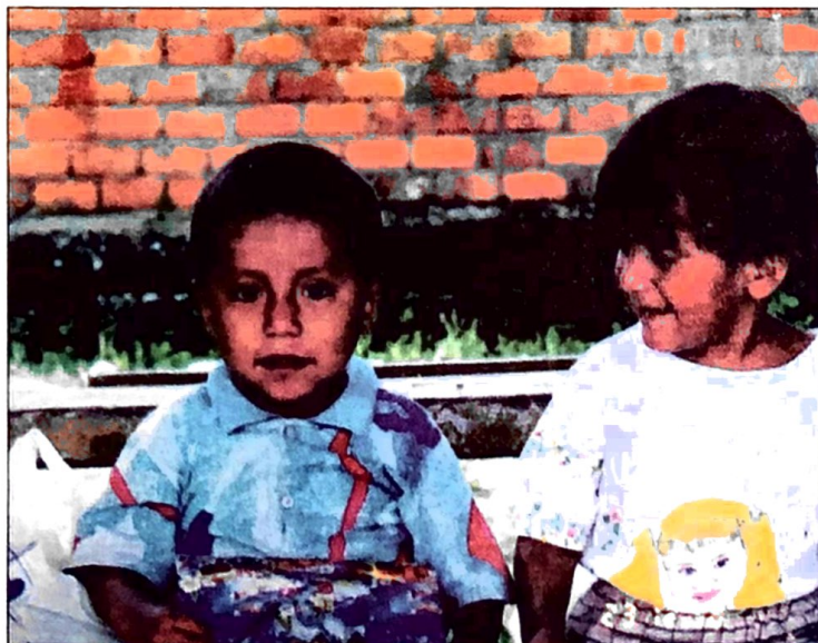
Sharing Christmas with Peruvian orphans.