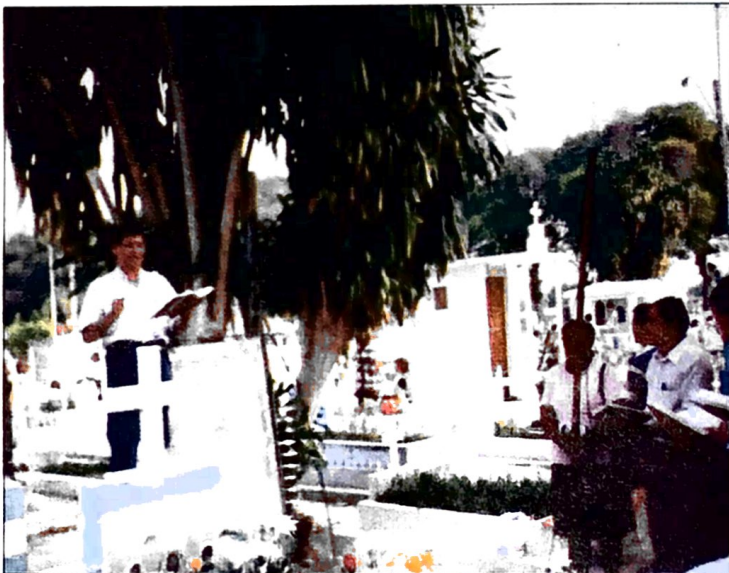
On the "Day of the Dead" this national pastor preaches the gospel to those who are dead in sin