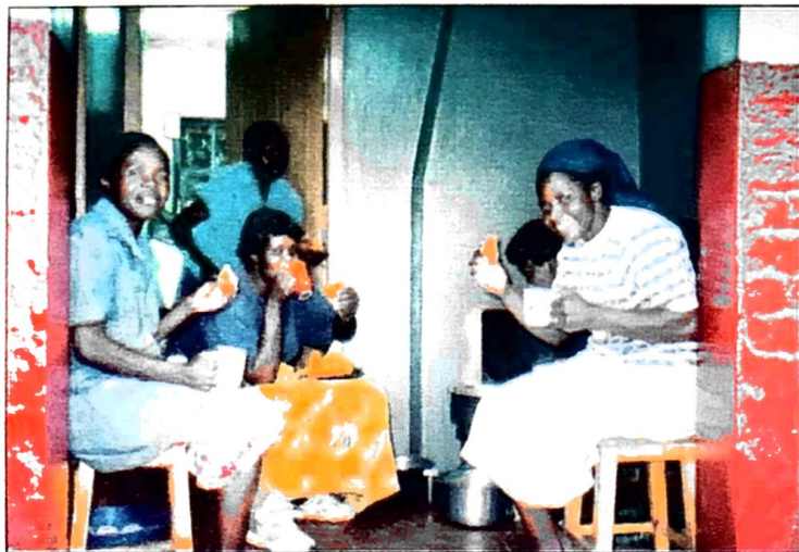
Our Bible studies ladies enjoying a snack after Bible study.

This month has been very frustrating for us. We finally were able to get our new 'used' car shipped in from Japan. We do this because we need a car with right hand steering, and also the cars that come directly from Japan have not been abused by the Kenyan roads. The problem is that we have not been able to get the car through Kenyan customs yet. Our agent has tried diligently to meet all the many requirements to try to get our car in tax-free, but the tax department keeps delaying the process. If we were to pay the tax, we would have to pay 80% of the value of the car! We just cannot afford to pay