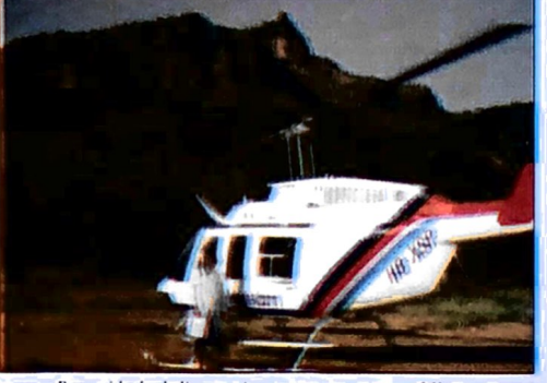
Pam with the helicopter in a very

It was a full day, and I returned home after traveling by