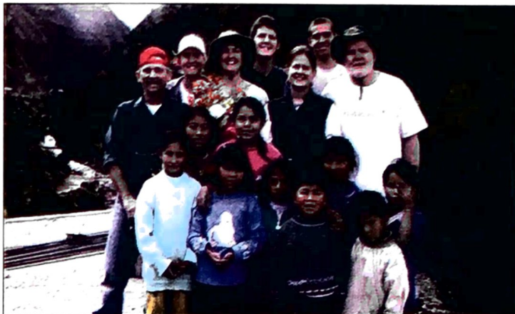
Making new friends on the Inca Trail

"We have been updating the 'www.bfmma.org' website every night with pictures. I think that is a great idea. That way the people at home can see what we are doing here. I do feel that our presence here is making a difference or having an effect on the work of the Lord here in Peru."