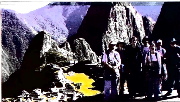
At Machu Pichu