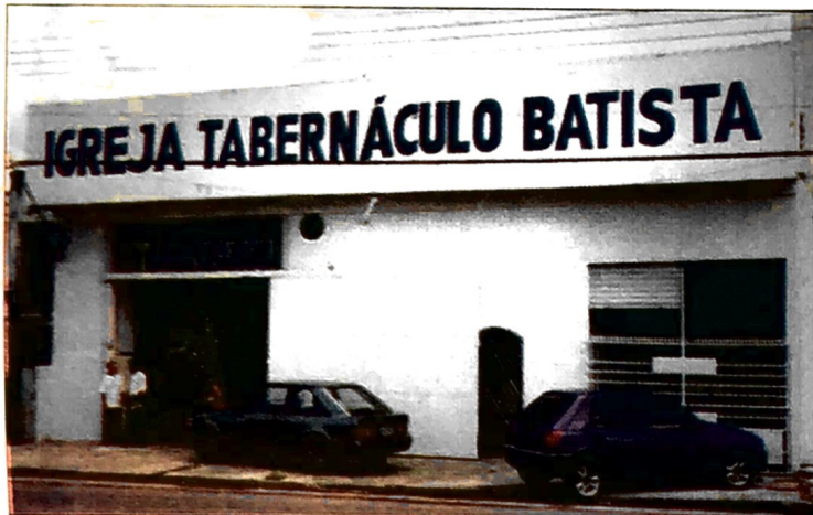
Tabernacle Baptist Church, New mission point, Belem, Para.