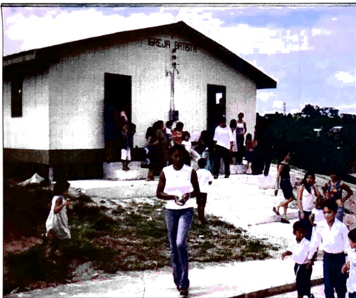
New building at Thaumeturgo 300 miles up river from Cruzeiro do Sul, Brazil.