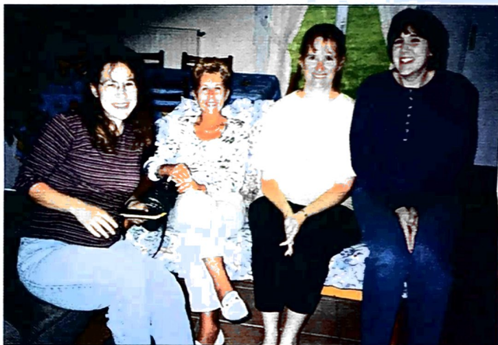
Prayer Partners from many countries: France, New York, West Virginia and Kentucky