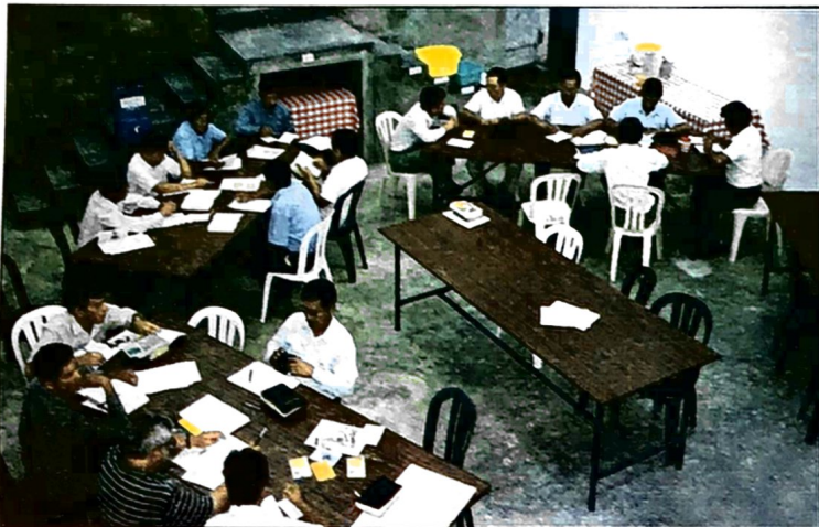
Pastors attending Evangelism class of Baptist Institute in Huanuco, Peru. Here they are in small groups writing their own tracts