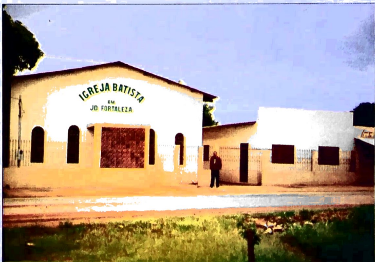
Church building and pastoral house at Jardim Fortaleza. Brother Draper's work.