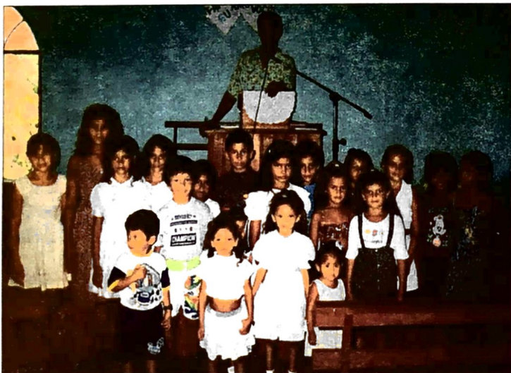
The children's choir at the New Jerusalem Baptist Church