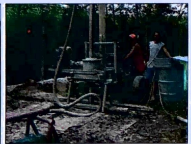
Drilling well at Haven of Hope Children's Home.