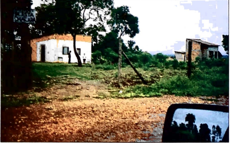
Picture of lot in new area where Harold Draper plans to open up a new work