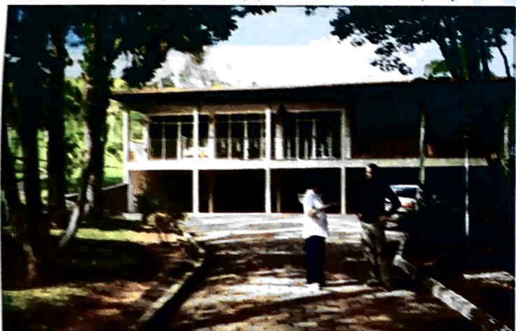
Future home of the Haven of Hope Children's Home.