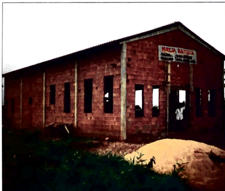
New building at Varzea Grande now complete and in use. Brother Draper's work. Please read his letter and his plea for funds to complete other buildings.

on the building construction in the Cuiaba community of Jardim Fortaleza/Sta. Laura. We have it under roof and closed in. We still need to wire it and do the plumbing, etc. We are running a little short on funds but believe we will have enough to make it usable soon.