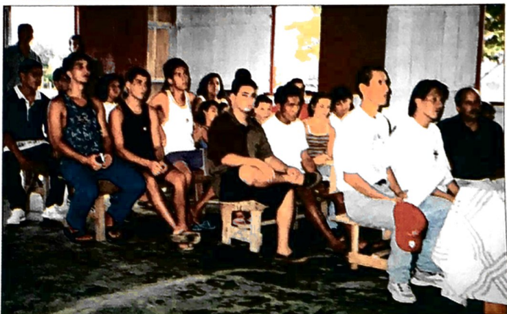
Service at Penal Colony, Cruzeiro do Sul, ACRE.