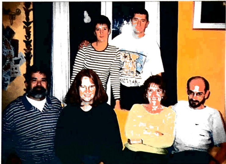
Part of the Bible study group that meets weekly in the town of Monteigut-sur-Save.

3. Open doors - On the day we signed the rental contract, God began providing opportunities for us to build relationships. On the second evening one of our neighbors organized a "block party" so that all of the neighbors could become acquainted. In one evening, God did what we thought would have taken months, maybe years. That very evening, one neighbor asked if she could come to a Bible study when we began having them. We have become good friends with many of these families. The friendships continue to offer us opportunities to share the gospel.