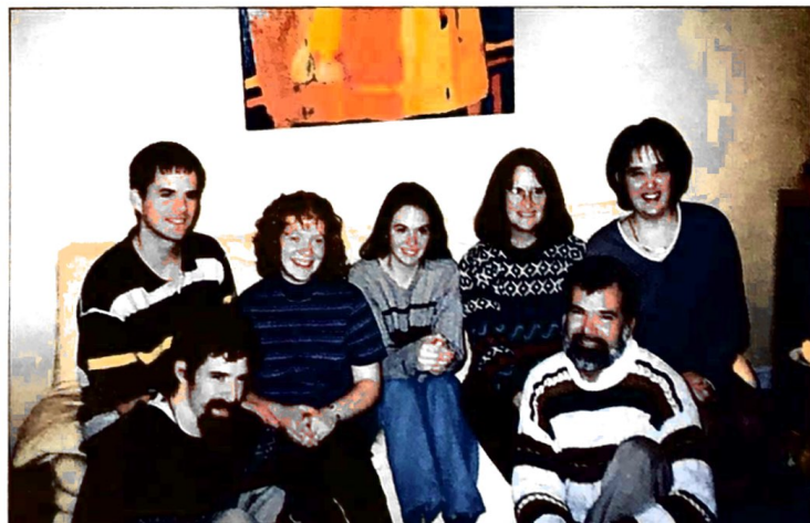
Visiting and sharing the Gospel with new friends.