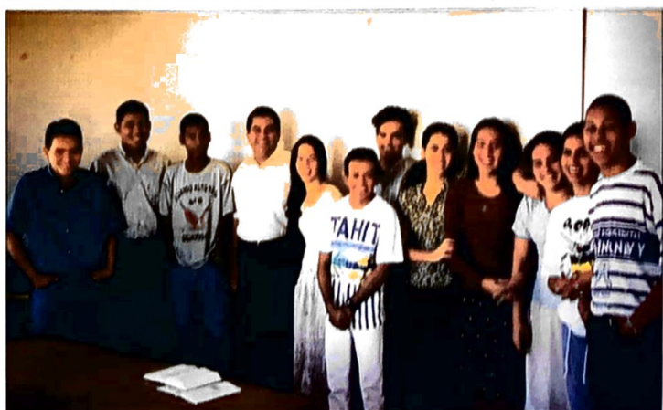
Young people's Sunday School group. Altos Coxipo Baptist Church, Cuiaba, Brazil.

I had planned to invite the family in Novo Diamantino to come here to Cuiaba to help out to open up the new work here that we hope to open up this year. I have already moved them down here to get started on that work. Of course, that leaves the church there without a pastor. The Lord has provided a young family from an Independent Baptist church from the city of Sao Paulo. I took them to that church field yesterday to start working with the church. They will stay until the end of June at which time the church will make a decision on whether to call them on a permanent basis.