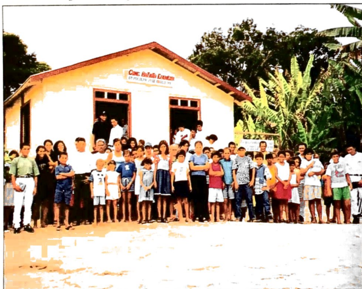
Dedication service at Pucalpa, on the Juruá River.

Let me share with you some of our goals and vision. I won't mention the home church's goals, because they should be the same in your own church. In other words, no need to mention church growth and expansion of facilities, etc.