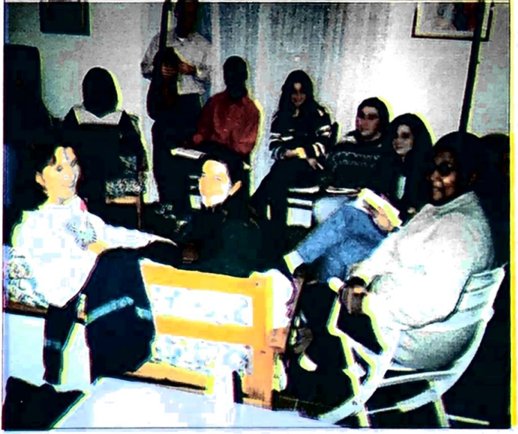
Singles Bible Study