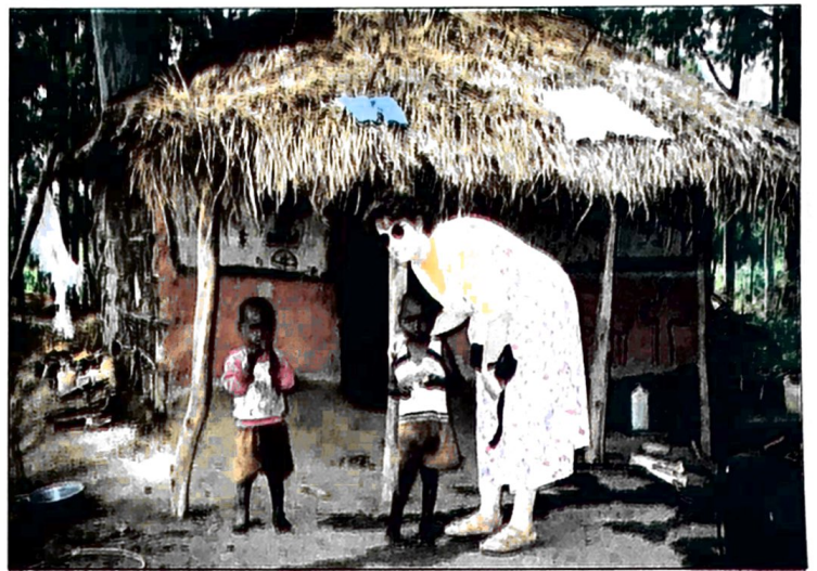
Visiting in a neighborhood not far from our church.