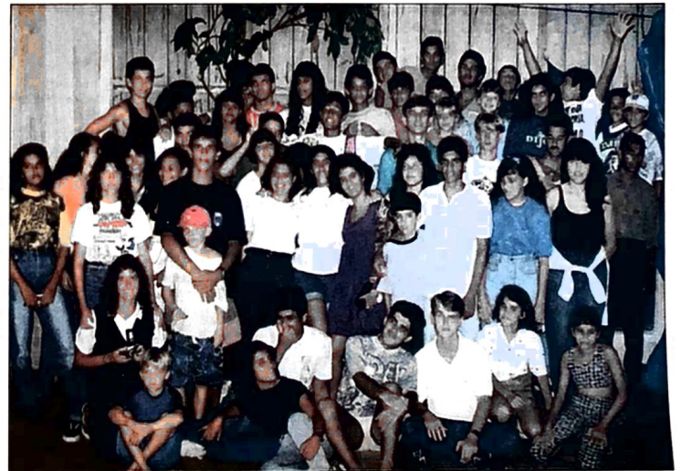
Group of young people at Cruzeiro do Sul.