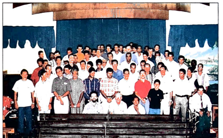
National Pastors who attended the recent conference in Cruzeiro do Sul.