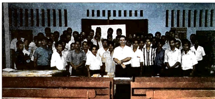
Institute Class in Iquitos, Peru.