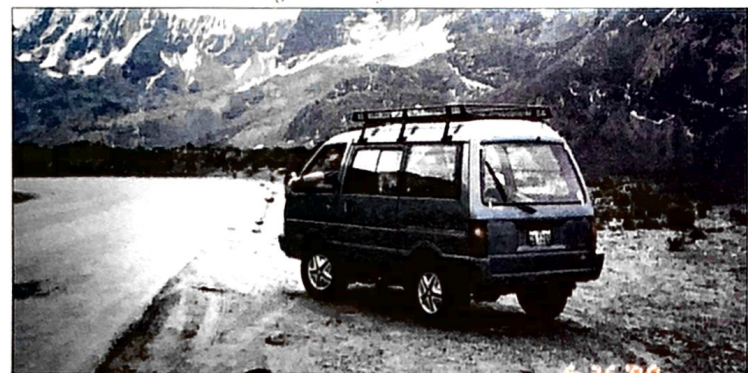
Brother Stanton's 1992 Nissan Van recently purchased for use in the mountains of Peru.