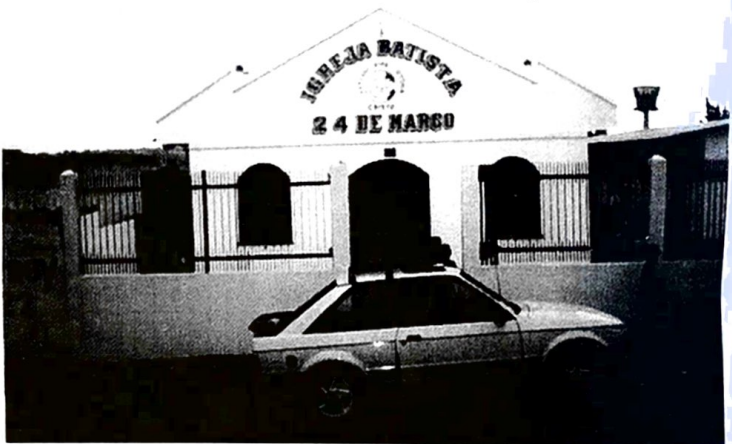
Front and side of the new 24th of March Baptist Church, outskirts of Manaus. Organized March 1999.