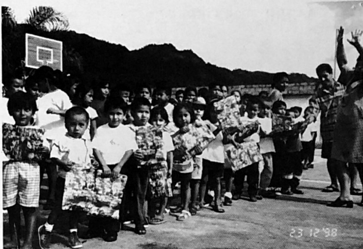
Orphan children receiving Christmas gifts in Tingo Maria, Peru. A total of 375 gifts were given to children in the orphanage and various churches. Gifts were made possible by a gift from Storms Creek Baptist Church, Ironton, Ohio.