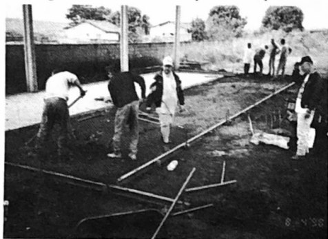
August 4 - Setting forms for second pour.