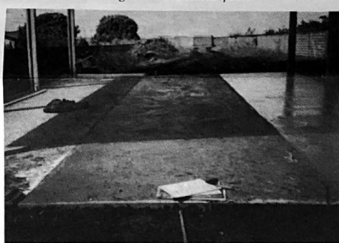
August 5 - Third pour and floor is finished.