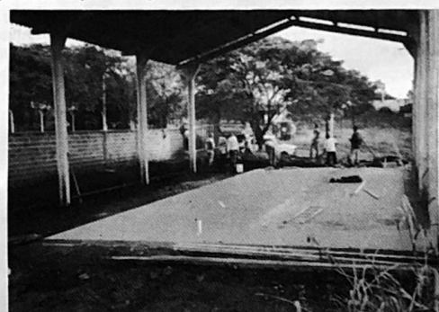
August 4 - The second pour.