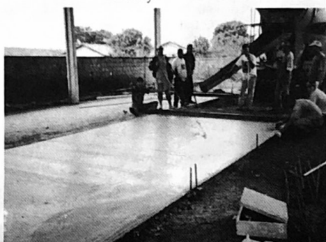
August 4 - The second pour.