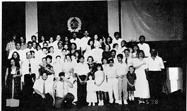
Brethren came from six States to attend the Jubilee of Tabernacle Baptist Church. They came from San Paulo, Acre, Mato Grosso, Paraná, Rondonia, Amazonas.