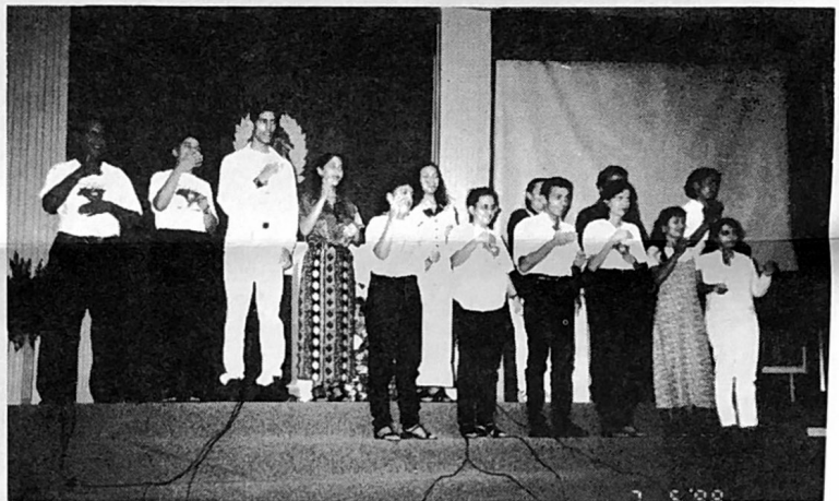
The silent sing. Here is the choral of the mute as they sing in deaf sign language during the Jubilee festivities. They have a ministry for the deaf in every service and now they have two deaf who minister to those who cannot hear.