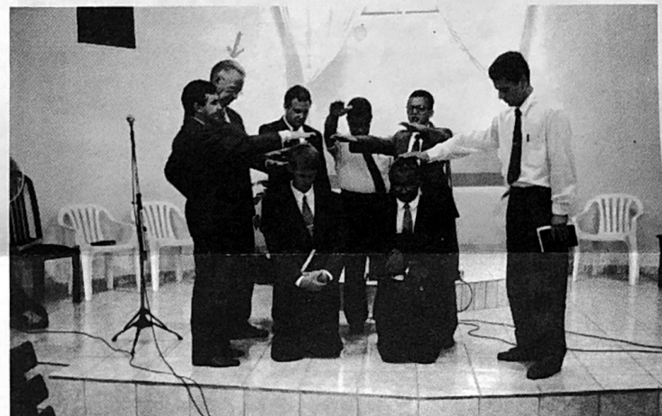
Baptist Pastor participating in the laying on of hands at the Ordination of two more faithful servants into the gospel ministry.

The church where I am serving as Missionary-Pastor has really improved in the Sunday School attendance since the beginning of the year. We had a young man in his 20's make a