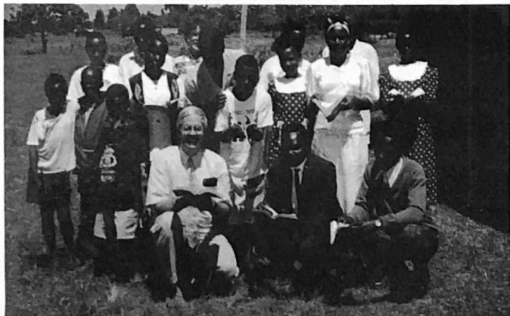
Our first church service in our new church, Calvary Baptist Church of Kitale. These are people who came for our first service.

We are enjoying our new 'used' vehicle, and we have used it a lot already to transport people, supplies and church pews. We are still waiting for the paper work to come through from the port, and after that, we will have to go back to Nairobi to finally get our permanent registration for our vehicle. This whole process of getting a ministry vehicle has really taught us patience!