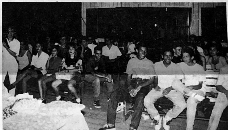
Youth Night at Priveira Igreja Batista Cruzeiro Do Sul.

Our ministry teams have suffered more than the other parts of the ministry, but not because of the teens. We are encountering a lack of faithfulness in our adult leaders more than with the teens. Things of the world like money, education, etc., often become more important than ministry and it's the teens who suffer. But I thank God for my leaders who have stayed faithful because their teams are doing great and the teens are growing spiritually because of it. Our evangelistic team is still going out every Monday night and witnessing door to door to other teens and the Lord is really blessing their efforts. Beside the fact that teens are making professions of faith almost every week, the members of the team are becoming bold in their witness. They have experienced the power of God in their lives and