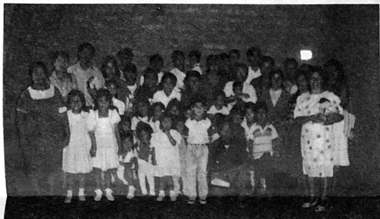
Saints of the New Mission in Huanuco, Peru. They need help to plaster the walls and pour the floor.

A little boy walking down the street with his mother one day, he told her that when he grew up and earned a lot of money he was going to help a missionary. He said, "I think I'll support a whole mission station and a hospital too." "Are you sure you'll feel that way when you get the money?" asked the mother. "Oh, I know I will!" he answered confidently. "If I had it right now, I'd give it; but you know I don't have any." Just then he spotted a coin on the sidewalk. Before his mom could get out the word "missionary" he had darted into a nearby store. Moments later he emerged with a pocketful of his favorite candy. So many are like this little boy.