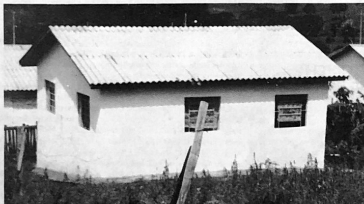
New house purchased in Casa da Familia Mission. This is a corner lot and there is space for enlargement as the work grows. Have you had a part? We would love to have new partners.