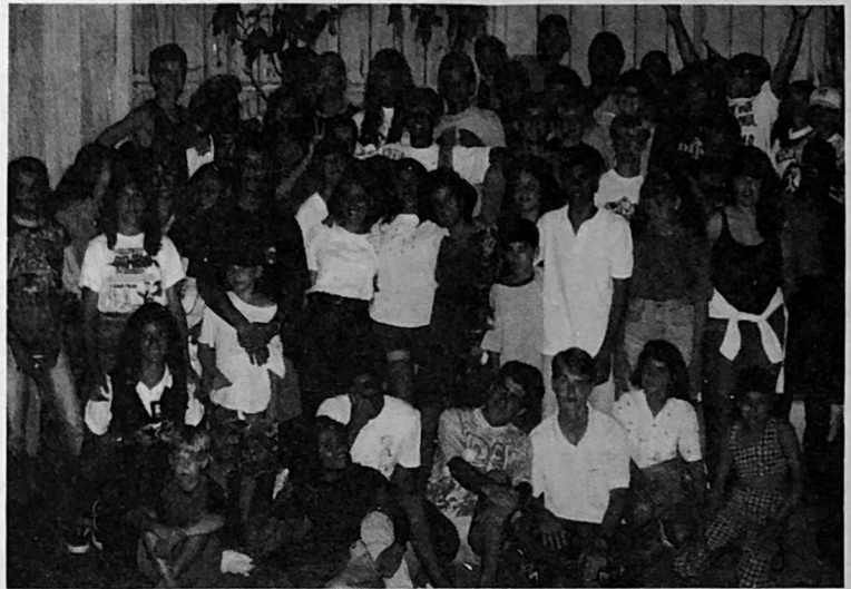
Group of young people at Cruzeiro do Sul.

The preacher's meeting was attended by almost 50 workers. Our missionaries told about how they were called to their fields. Some of these stories were told with tears and some were filled with laughter. It was one great meeting. It has taken pretty much the whole 10 years to teach the men that the need for these meetings is our fellowship, sharing. For a long time, human nature being what it is, they kept begging for some kind of "convention," complete with officers, minutes and all that. Hopefully that phase is in our past. It seems now that they have finally understood and have really come to enjoy what has developed.