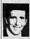
Sheridan Stanton Peru, S.A.