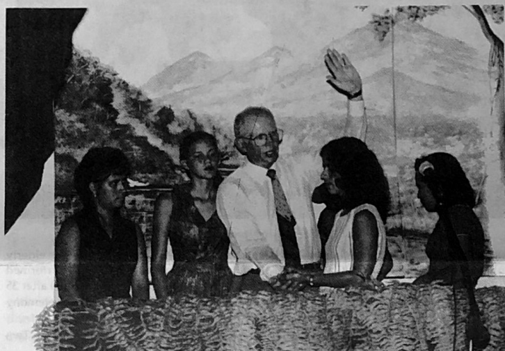
Baptism at Cruzeiro do Sul

Yesterday morning, we flew in here with a team of doctors, dentists and nurses, to make our yearly visit to the upper Jurua. The team has 2 doctors, 2 nurses, 2 dentists, the pilot and me. These people come from all over the country to volunteer their services once a year. Each year, we have some new members. These people are all dedicated Christians who give of their time to treat people's bodies and souls. It has been great to see how the village people recognize the difference between saved doctors and lost doctors. For one thing, the lost doctors never come here and another difference is that the lost doctors are always rude and often mean.