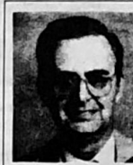
Harold Draper Brazil, S.A.