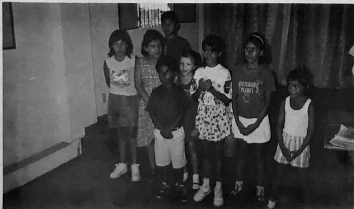
The children's choir, 29th of March Baptist Mission, Manaus, Brazil