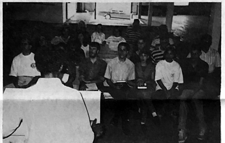
Closing program of Seminary semester at Garca. Students from Cornelio, State of Paraná, and Garca, State of São Paulo

...August 15. Letter interrupted because I went to see about buying a house and lot. The house is run down and worthless, but the lot can be used for building and it is in the area we want. I told the person responsible for the house we wanted to buy and hopefully the owner (who lives in another city), will sell. This house and lot will cost $3,000. The house can be used temporarily although it is in precarious condition. Some building will have to be done soon.