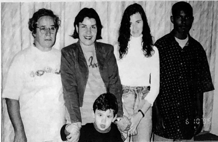
These four people were recently baptized in the Tabernacle Baptist Church in Cornelio Procopio.