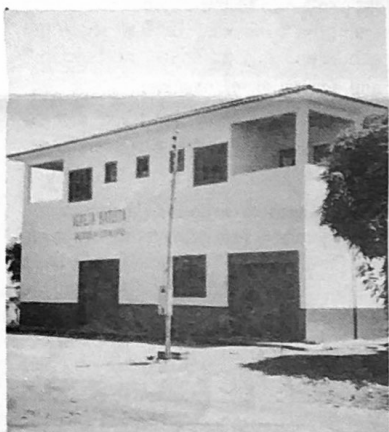
Building at Altos do Coxipó Baptist Church (Made possible by your faithful giving)