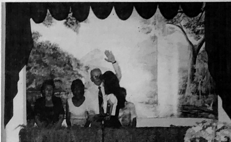
Baptism at First Baptist Church, Cruzeiro do Sul, Acre, Brazil.

Two different groups of charismatics started works at Porto Walter. One has already failed and the other, although a little older than our work, has less than 10 people in attendance. Meanwhile the Catholic convent has only a tiny group of girls, the seminary has closed and they do not even have a priest living there anymore! Last year a young, popular