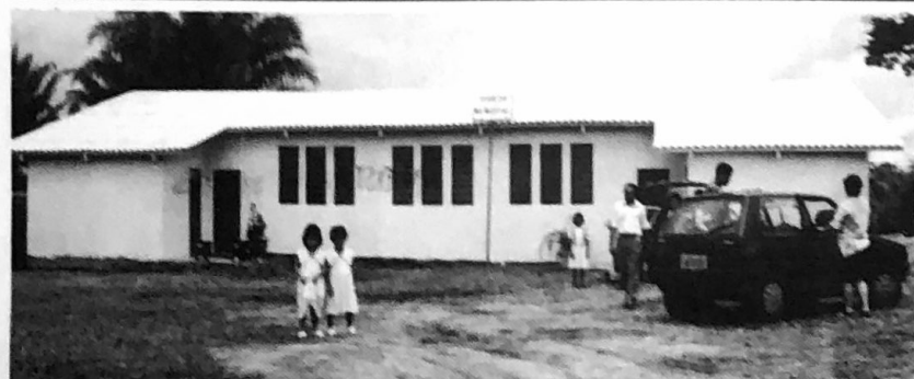
Mission at Rio Branco, Acre, Brazil.

Second Class Postage Paid at Warren, Michigan.