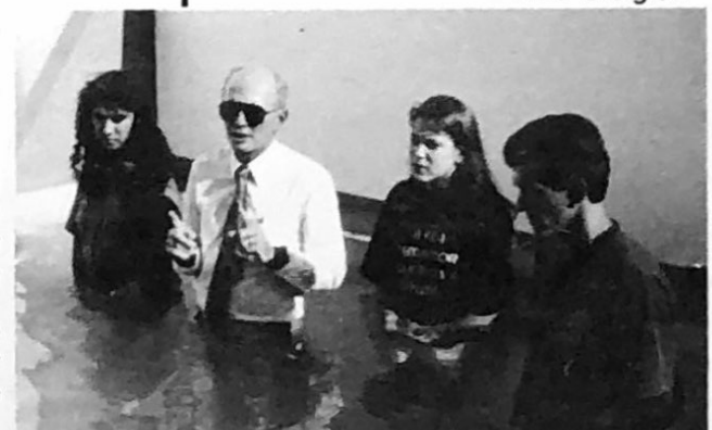
Baptism in Rio Branco, Brazil.