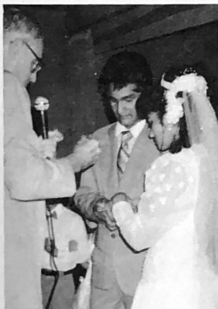
Wedding of a young couple at Nono Jerusalem, March 2, 1996.

February 21 - This afternoon I made visits on the field of the 29th of March