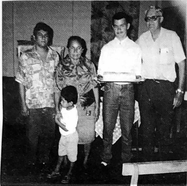
The 29th of March Baptist Mission.

P.S. More good news: The Marie Bratcher buildings at the Olinda Baptist Mission have been built.