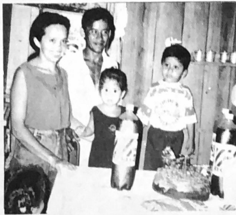
Dec. 8, 1995 - A faithful family of the New Jerusalem Baptist Church in the interior of the Amazonia. We were with them celebrating the little boys' birthday.