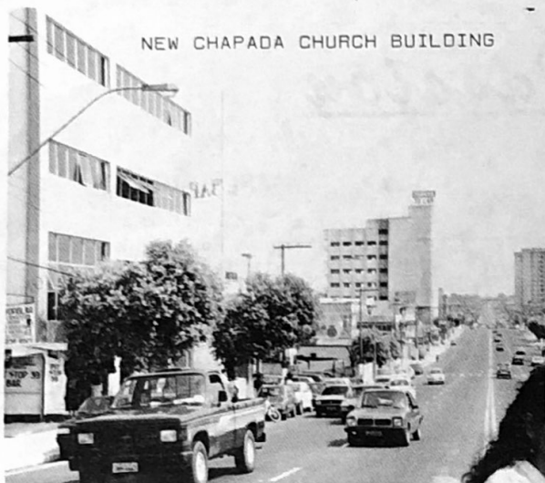
NEW CHAPADA CHURCH BUILDING