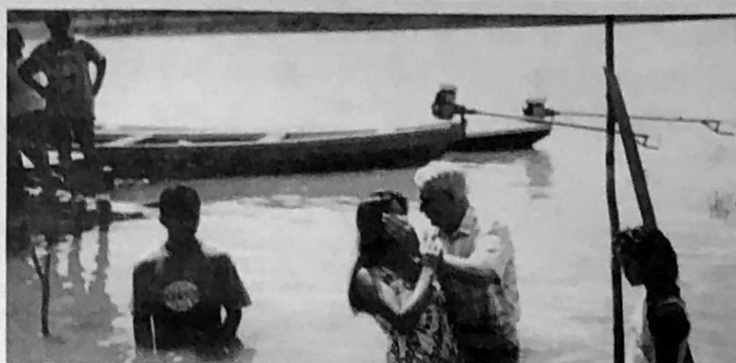
Young lady being baptized into the fellowship of the New Jerusalem Baptist Church.