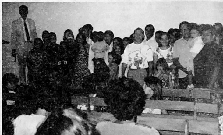
The Charter members of the new organized church at Altos do Coxipo.