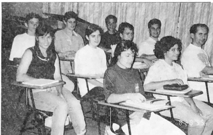
Ten Seminary students in Cornelio. These are all active in the Lord's work. New work has been started in one new town and two new areas of the city of Cornelio a city of 80,000.