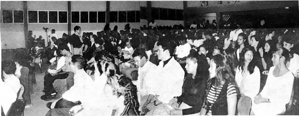
Partial view of the crowd present at the inauguration of the new Chapada Baptist church building. 650 persons present.