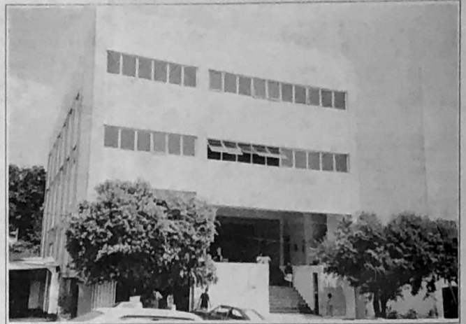
The new Chapada Baptist Church building. A three story building with parking on ground floor. Built without the financial help of others and without indebtedness. Truly a monument of faith and God's provision.