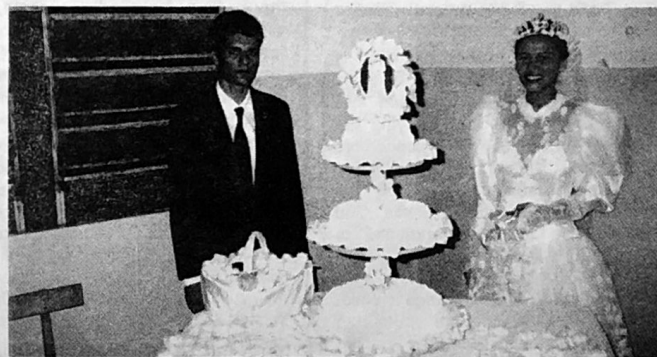
Wedding at 14th of December Baptist Church, Manaus.