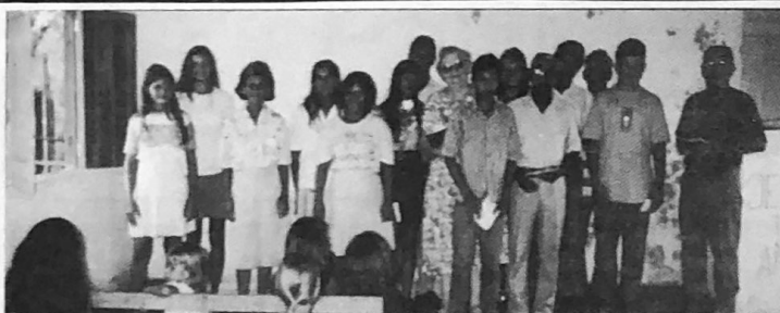
The Adult and Young People's Class at Nova Remanso.